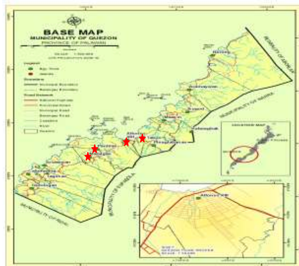
Figure 1. The Map of Quezon, Palawan Showing Study Sites

The study was conducted from October, 2015-January, 2016. The pre-service teachers of WPU-Quezon Campus were deployed in cooperating schools during the first semester of every school year.